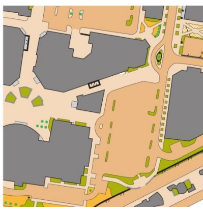
Kanata City Walk